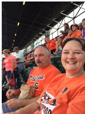
Lutheran night at Camden Yards