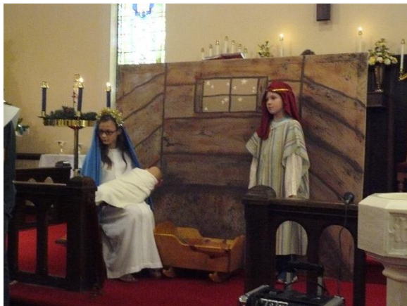
Mary and Joseph with the Baby Jesus.