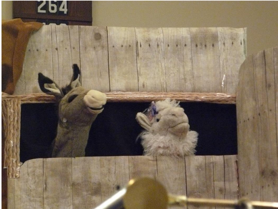
Dominick the Donkey and Lucy the Lamb brought us the story of the Christ Child.