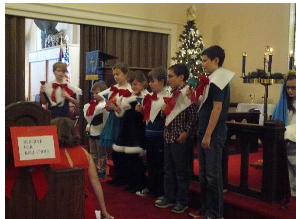
Bell ringers added to the spirit of the story.