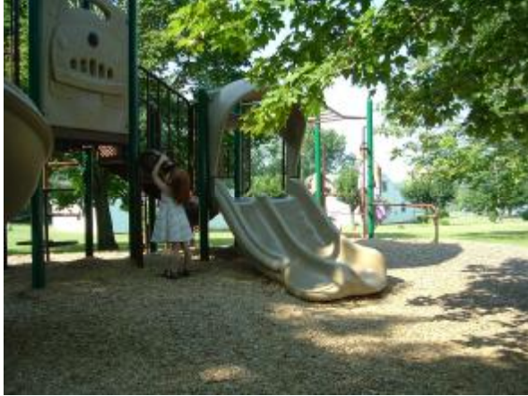
Playground in use