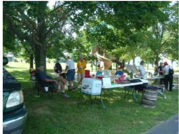
Flea Market July 2008