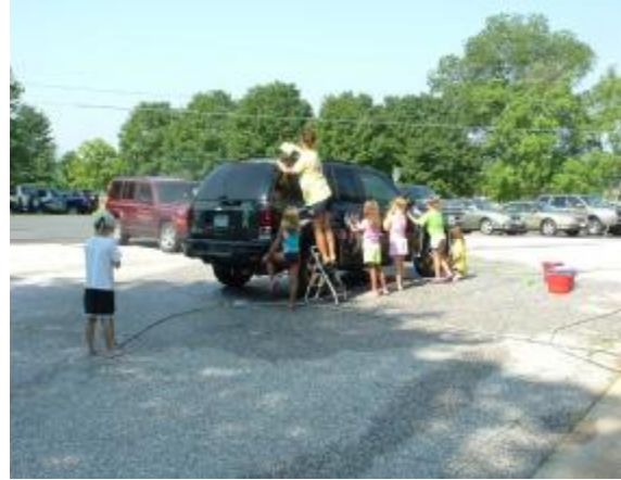
SPY Car Wash July 2008