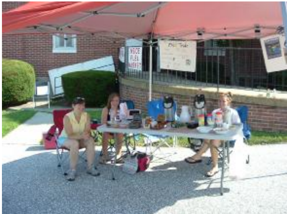
SPY Fair Trade Coffee & Chocolate Sale