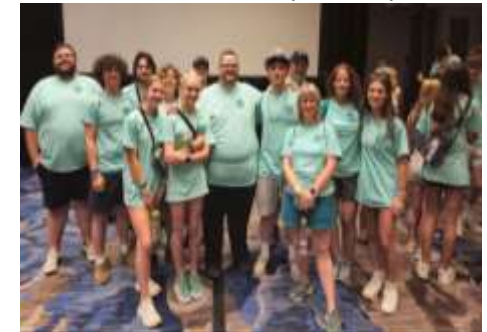
Our group at our Synod Day