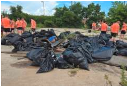
The pile of trash that was collected