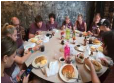
Lunch at Mother's Restaurant