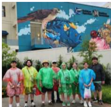
Our ponchos came in handy