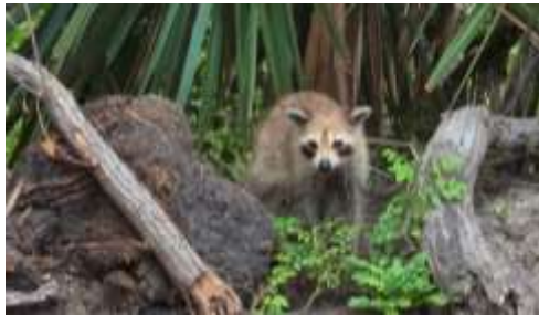
Our raccoon friend on our swamp tour