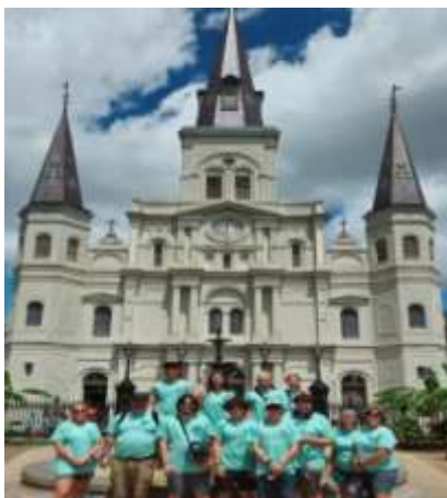
St. Louis Cathedral, French Quarter