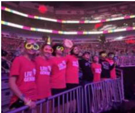
Mass Gathering fun