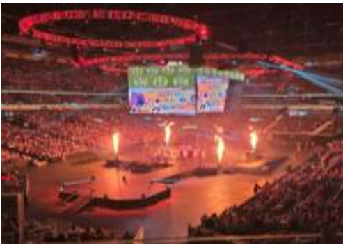
Mass Gathering at Smoothie King Center