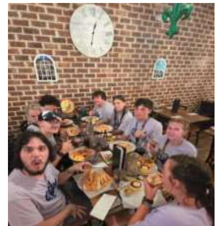
Our last lunch in New Orleans at the Streetcar Cafe