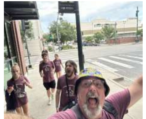
On our way to Smoothie King Center