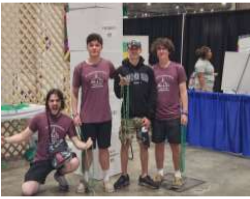
Having fun during our Interactive Learning Day