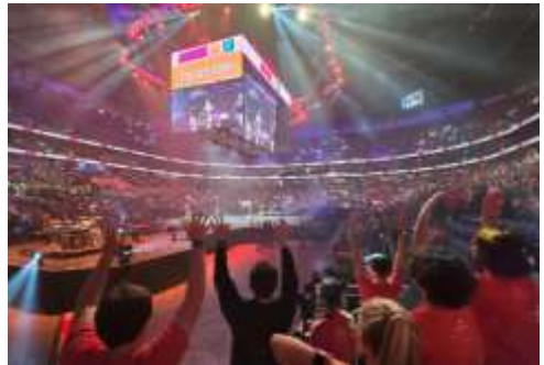
Mass Gathering at Smoothie King Center