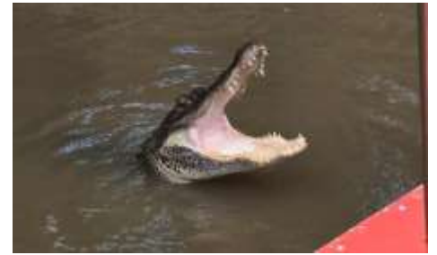
One of many alligators we saw on our tour.