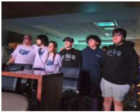
Our suite at Smoothie King Center during Closing Worship